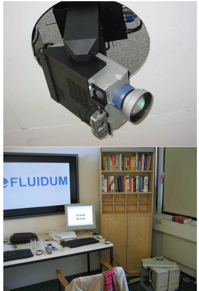
Figure 1: The steerable projector mounted on the ceiling (top) and one corner of SUPIE with a book shelf (bottom)

The Saarland University Pervasive Instrumented Environment (SUPIE) is an instrumented room with various types of displays, sensors, cameras, and other devices. By means of a steerable projector, the room has continuous display capabilities which are limited in resolution and temporal availability (only one area at a time). The various other displays provide islands of higher resolution and interactivity within this display continuum. The projector can project arbitrary light